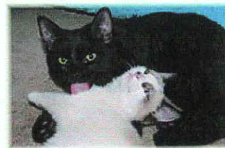
*Iggy & Grace loving on each other.

Iggy has fallen in love with her and treats her like his baby, he carries her by her neck scruff and deans her and washes her, he is so tender with her. We named her Grace, as in saving Grace. Grace loves Iggy too!! ♥