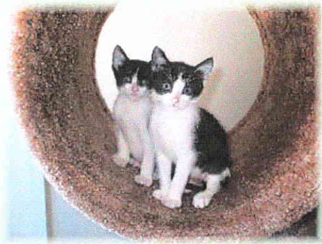
*Oreo & Bojangles happy in their tree.

Christmas came and went and along with the new year came many changes. The kittens are growing up healthy and every day become more and more a part of our family. ♥