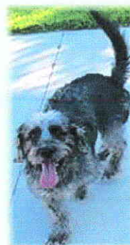
*Woody at home.