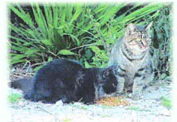
*Two feral cats eating at drive-thru restaurant colony

The cats might not remember the two trappers who got so excited each time a trap door slammed closed and who are very thankful they were given the opportunity to help these beautiful animals have a better chance of survival, but one thing is for certain, the two trappers will never forget them. ♡